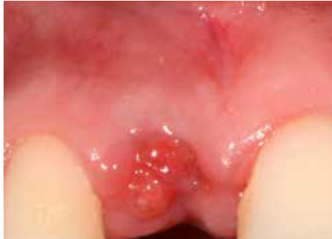
3 weeks healing post-extraction