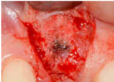
New bone at 12 weeks